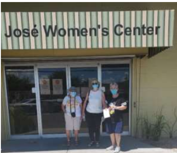
1Altrusa members delivering donations and checks to Sister José Women’s Center