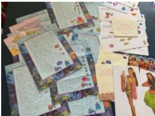
Handmade Letters Against Isolation

Another group of ladies has been busy writing " Letters Against Isolation " as part of a national outreach program started under Covid-19. As of a September, they created 690 cards and letters. Most of the cards have been handmade and each letter is hand written. Members have been stamping, coloring, stickering, using scrapbook materials, and repurposing old cards. We applaud their creativity! Our Make a Difference Day project has evolved into writing 146 cards for an autumn and Thanksgiving mailing to Senior Centers. We hope to have every member participate in this project.