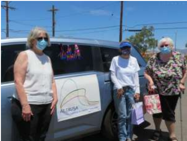
Car Parade Preparing to pick up donations for Sister Jose Women’s Center

The Club is also going forward with a Make-A-Difference Day project, October 24. Members will organize supplies for the local Fisher House, on the grounds of the VA Hospital, and bake single-serving desserts for the families of veterans and service members receiving treatment at the VA Hospital.